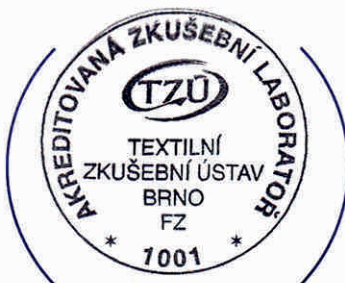
Head of Testing Department

The temperatures of the range of utility relate to indoor conditions for outdoor use wind may affect insulation of the bag to a large extent, especially if the shall fabric of the sleeping bag is air permeable. In this European Standard sleeping bags are considered as dry: high moisture content may lower thermal performance.